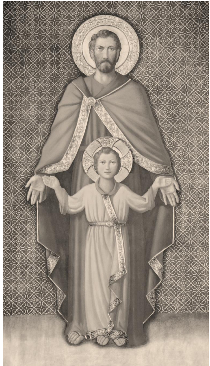
Painting of St. Joseph with the Child Jesus by J sus Faus in the Iglesia de Perpetuo Socorro, Zaragoza Spain